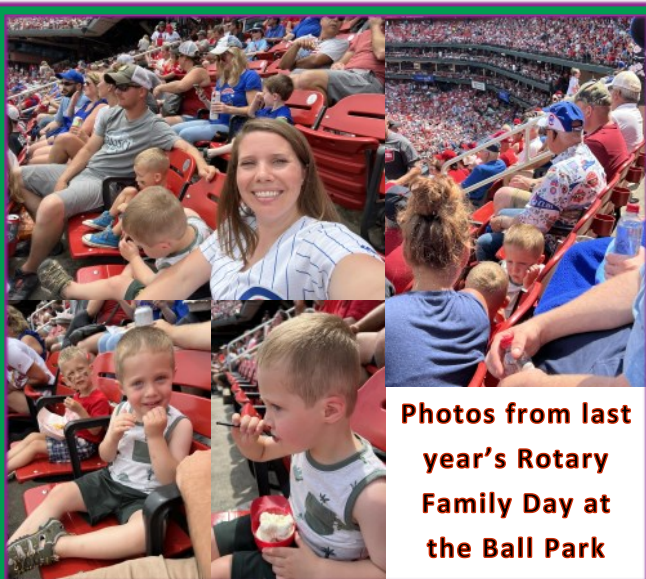
Photos from last year's Rotary Family Day at the Ball Park