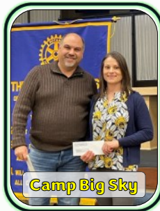
Camp Big Sky