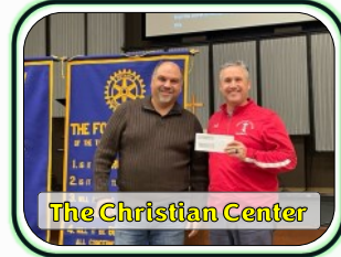
The Christian Center