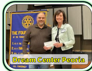
Dream Center Peoria