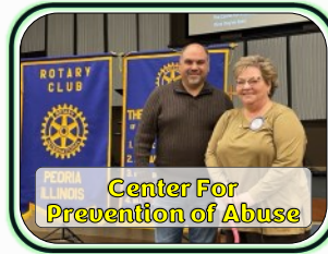
Center For Prevention of Abuse