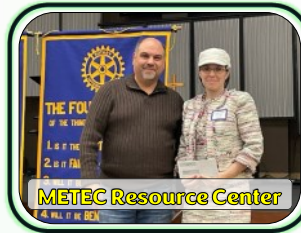
METEC Resource Center