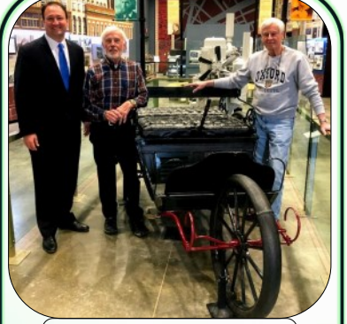
The "Motor Trap" at the Peoria Riverfront Museum

"Motor Trap" at the Peoria Riverfront Museum. You can see both the first Duryea (a replica) and the last Duryea car at the Wheels of Time Museum in Dunlap.