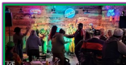
Peoria Music Live