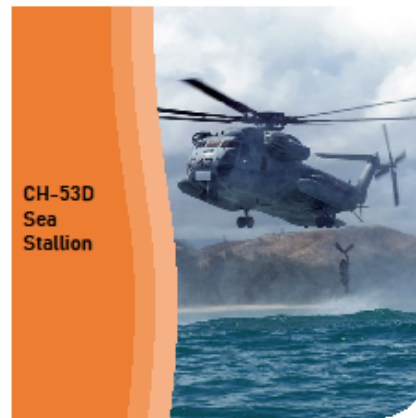
CH-53D Sea Stallion