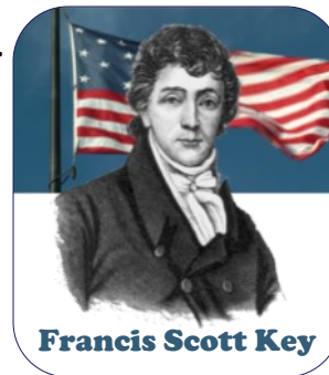
Francis Scott Key