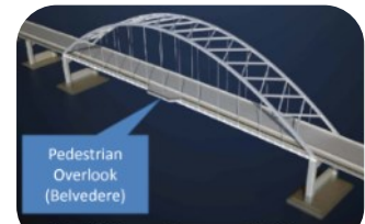
Aerial View of Proposed Bridge

Peoria's McClugage Bridge Project - started in the Spring of 2019. The eastbound bridge will be removed and replaced with a new structure to meet the region's transportation needs. The new bridge will include bicycle and pedestrian access and is expected to be completed in 2023. In addition, there are over ten applicants locally for some of the 105 million dollars set aside for walking, biking and trail projects in Illinois.