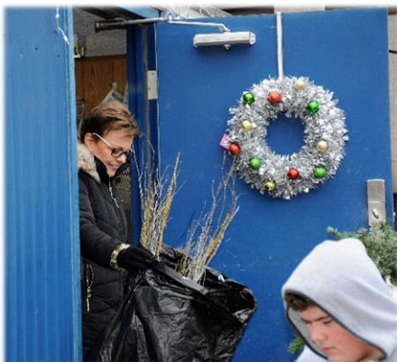
Dawn distributing decorations