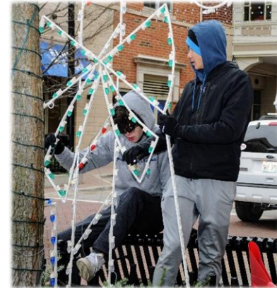
Getting it right