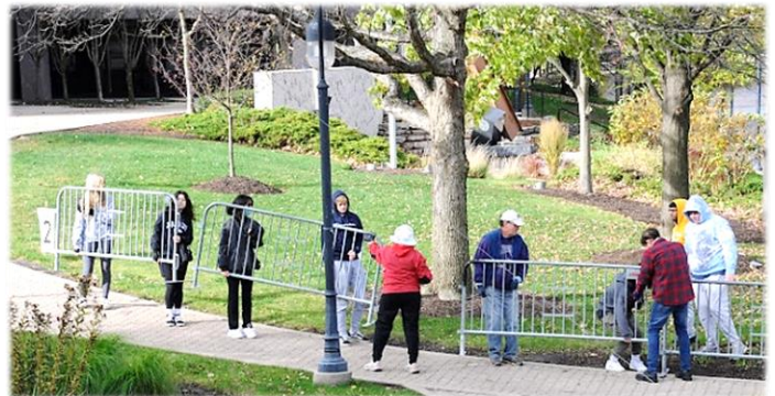
She's the setup maestro.