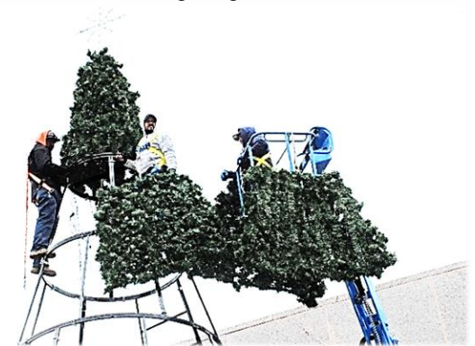
Assembling the tree