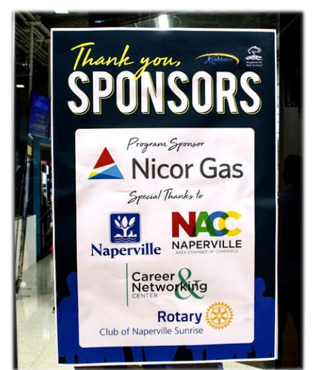
At the entrance - more exposure for Sunrise Rotary