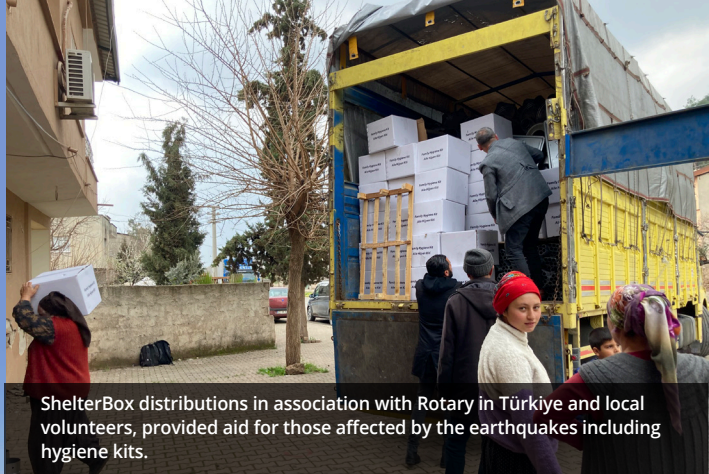
ShelterBox distributions in association with Rotary in Türkiye and local volunteers, provided aid for those affected by the earthquakes including hygiene kits.

Following conversations with Rotary, AFAD and local Government Municipalities, the deployed team developed an assistance package with a focus on tents and household items, to allow people to stay in their homesites and not have to relocate to larger cities in search of assistance.