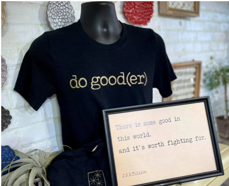
MY SECRET STASH Spark apparel line carried here