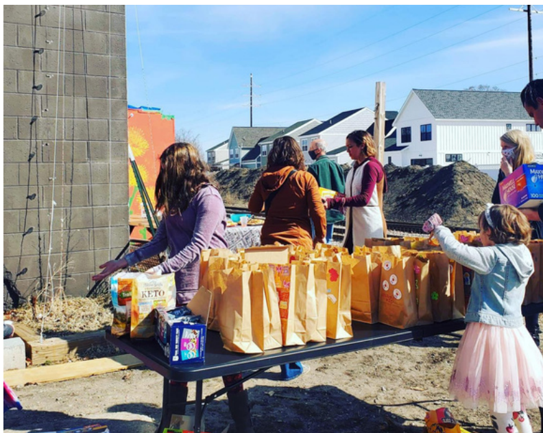
RESTORATION CHURCH Serve Sundays - get involved!