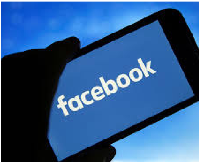
FACEBOOK, INC. Community Partnership Accelerator