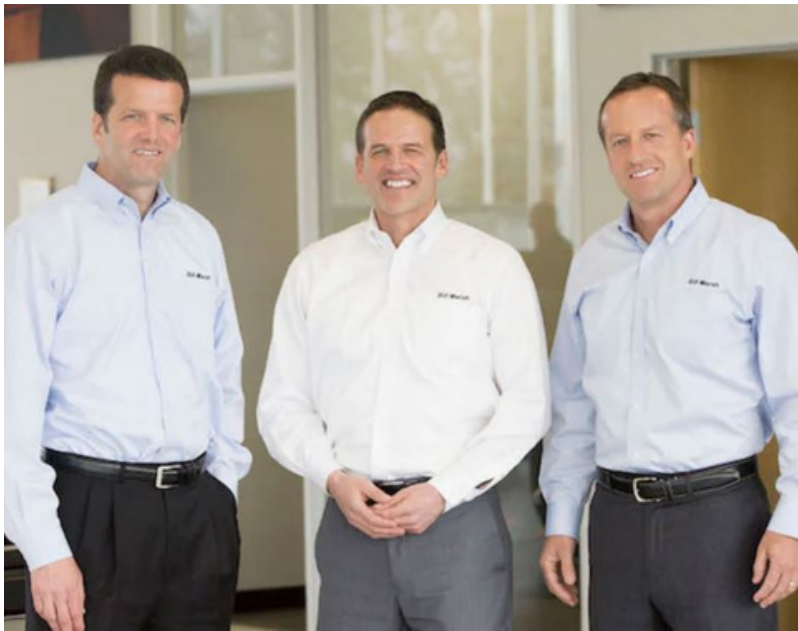
BILL MARSH AUTO GROUP Auto repair fund/ recurring donor

Our donors are a collection of wonderful businesses and individuals that help in their own unique way but all share the same desire to build community. If you're interested in joining our cause or our community we would love to share a cup of coffee and talk about what makes the most sense for everyone.