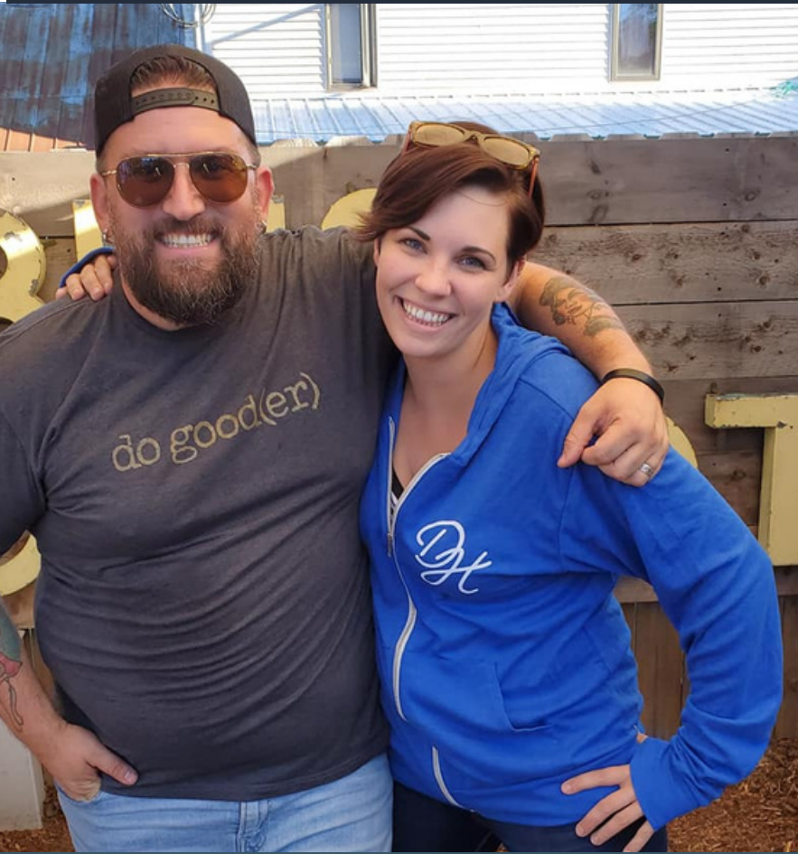
COUNTRY STAR- DREW HALE