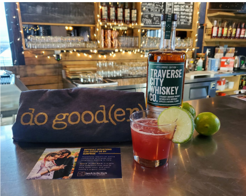
TRAVERSE CITY WHISKEY CO Featured Spark in the Dark drink