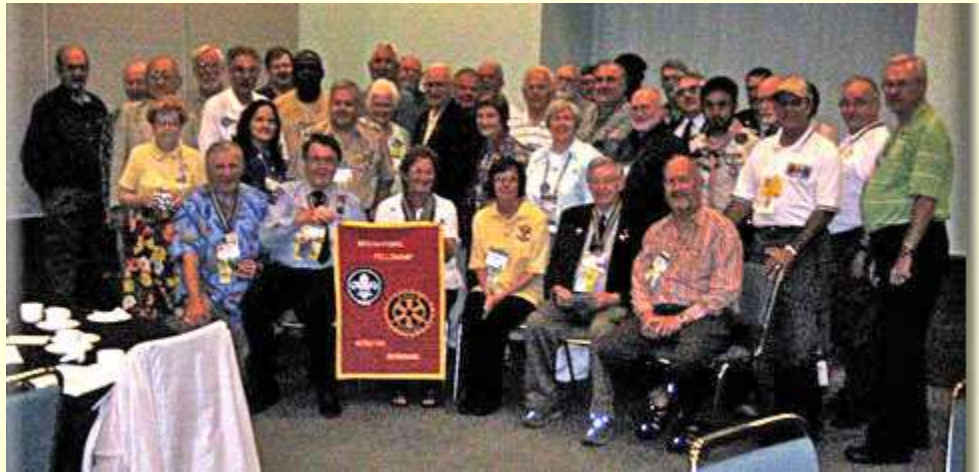
IFSR Annual Meeting at Rotary International Convention