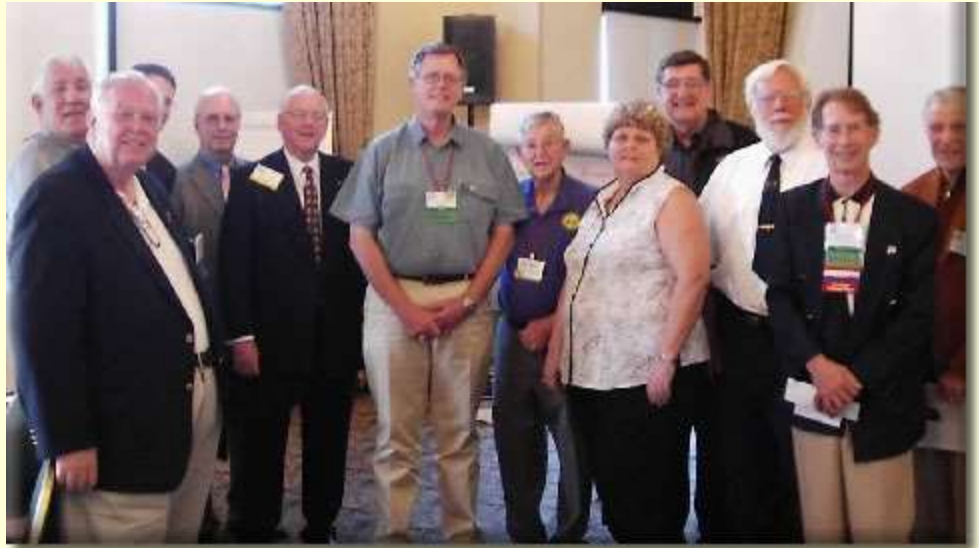
IFSR Annual Meeting at BSA National Meeting

It is made up of Rotarians, Rotarian spouses, Interact and Rotaract Members who are or were, also, members and/or supporters of the Scout and/or Girl Guide movements.