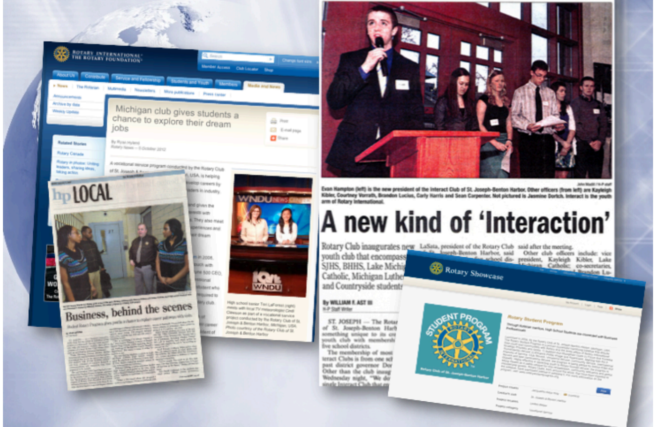
Rotary District 6360 and Rotary International plans to market program