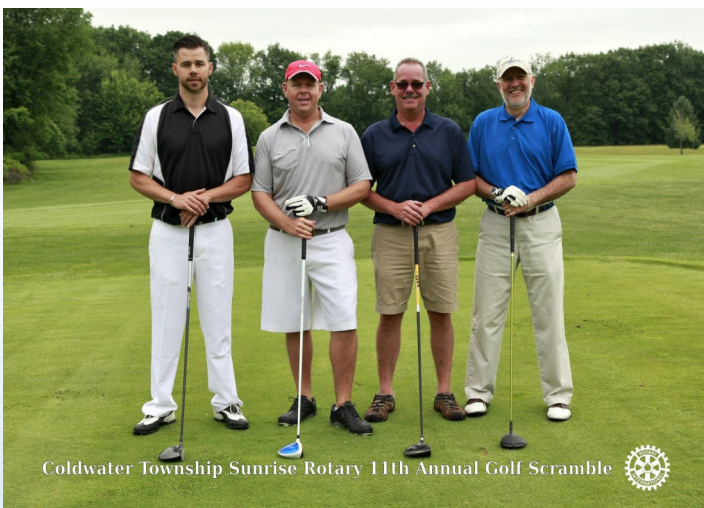
Coldwater Township Sunrise Rotary 11th Annual Golf Scramble

Recently the Club has completed a large project of renovating Coldwater High School Baseball and Softball fields, and smaller projects such as supporting Altrusa's Happy Feet Program and working with Coldwater Noon Rotary to replace the roof for our local theatre, Tibbits. Funds raised at this year's golf outing will support the most recent project adopted by the Club, the Rotary Splash Park. The Splash Park will be built in Heritage Park and will be a free water attraction for Coldwater and surrounding communities. Come visit us to hear more about how we make a positive impact on our community! Thursday mornings at 7:00 a.m. at the Coldwater United Methodist Church.