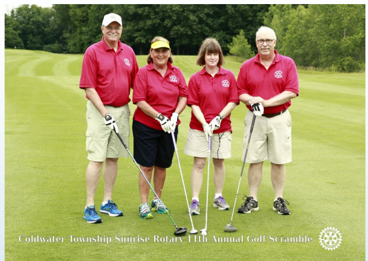
Coldwater Township Sunrise Rotary 11th Annual Golf Scramble