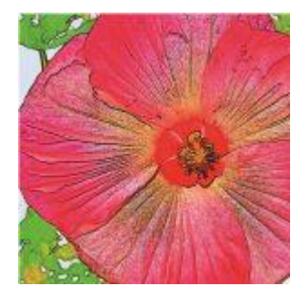
Sep 08 - Nov 30, 2018