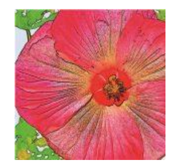
Sep 08 - Nov 30, 2018

learn and perform music.Participants pay only $30 per session; four sessions are held each year. There will be an end-of-session performance. Contact the office for enrollment details. This program is supported by the Michigan Council for Arts & Cultural Affairs/National Endowment for the Arts, the Irving S. Gilmore Foundation, and individual donors.