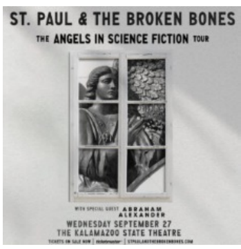
St. Paul & The Broken Bones — The Angels in Science Fiction Tour

custard throughout the evening. With live music providing the soundtrack, these are evenings you and your family won't forget!