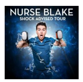
Nurse Blake: Shock Advised Tour