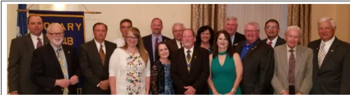
Members recognized for perfect attendance