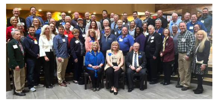
District 6080 attendees at the Show Me Rotary Institute

She has also served as chair of the Rotary Strategic Planning Committee and The Rotary Foundation's Centennial Celebration Committee, as well as a member of various Rotary committees, including the Election Review Committee and Operational Review Committee.