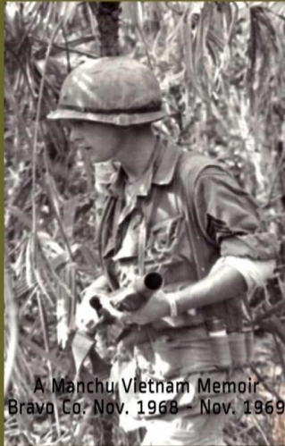
A Manchu Vietnam Memoir Bravo Co. Nov. 1968 - Nov. 1969