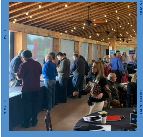
Retreat breaktime chat with Public Image, Youth Exchange and Foundation