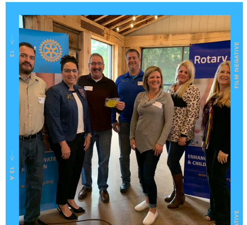
O'Fallon Rotary Members Receiving Century Club Award $100 per Member Donated to The Annual Fund of the Rotary Foundation