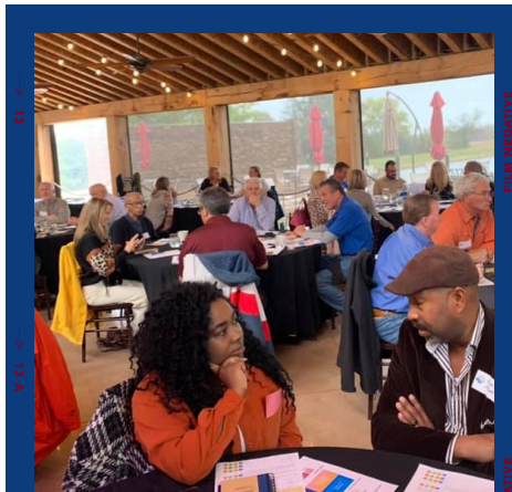
Retreat Discussion Breakout Session