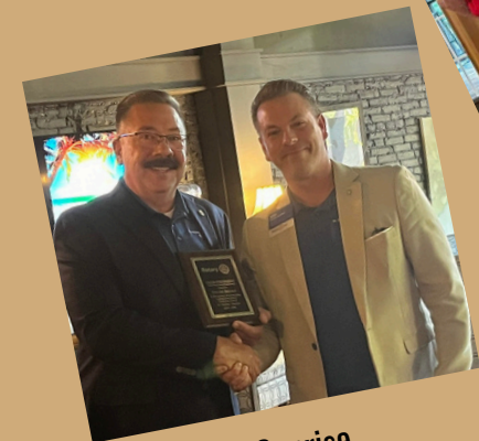
St. Charles Sunrise