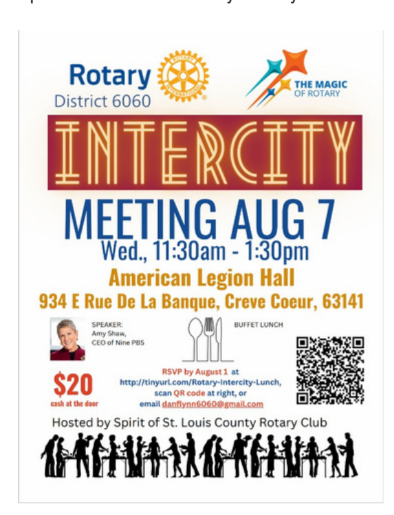
August 7 Spirit of St. Louis County Rotary Club hosts the August Intercity Meeting.

Here are some happenings around the district. These events are a great way to meet Rotarians throughout the district and to support your fellow Rotarians and the good work they do in their communities and the world!.