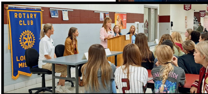
ROTARY CLUB OF LOUISIANA HOSTING FEMALE LED PANEL FOR HIGH SCHOOLS GIRLS