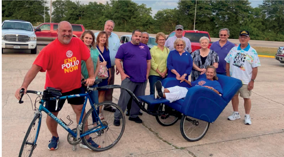
Riding in Kennett