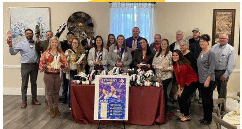
Troy Rotary Club with their shoe donation