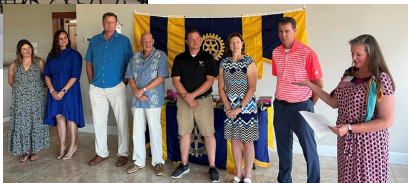
St. Francois County Officer Installation