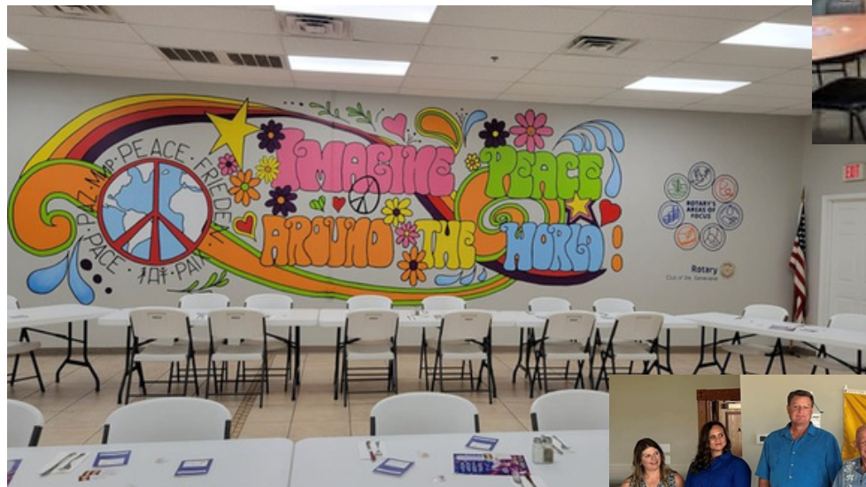
Ste. Genevieve Rotary meeting room