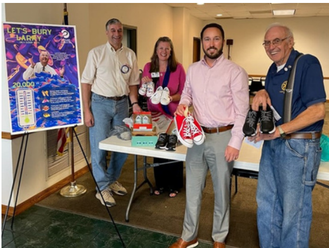
Cape Girardeau West Rotarians