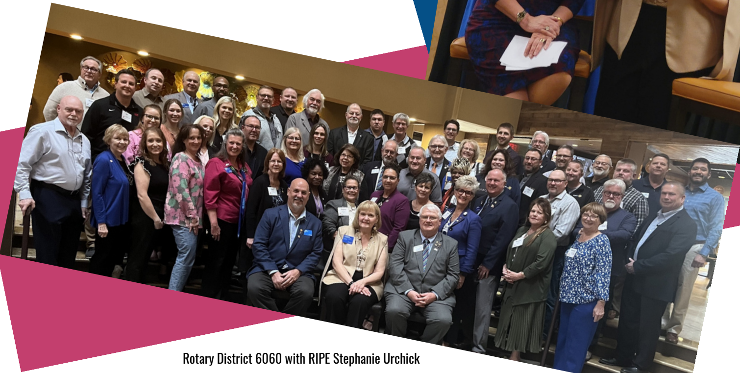
Rotary District 6060 with RIPE Stephanie Urchick