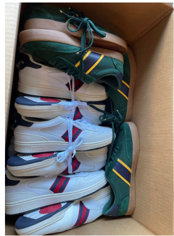
Examples of how to package shoes.

Address for shoe collection: Macadoodles 6050 Crossing Dr Osage Beach, MO 65065