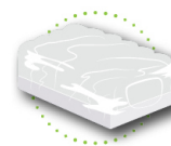
Wood pellet bags