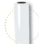
Pallet wrap & stretch film