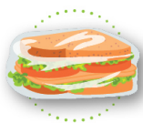
Ziploc & other reclosable food storage bags