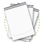
Plastic shipping envelopes