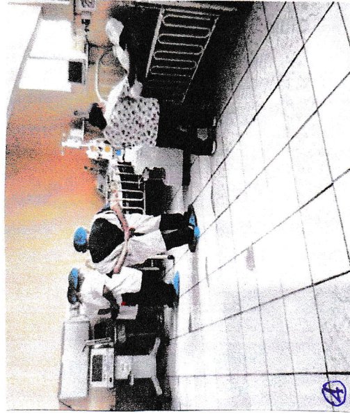
④ Existing Intensive Care Unit &