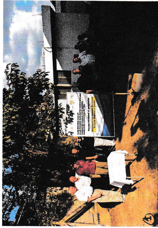
① Groundbreaking Ceremony