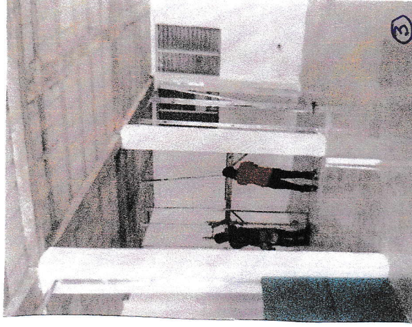
③ New Addition