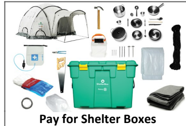
Pay for Shelter Boxes