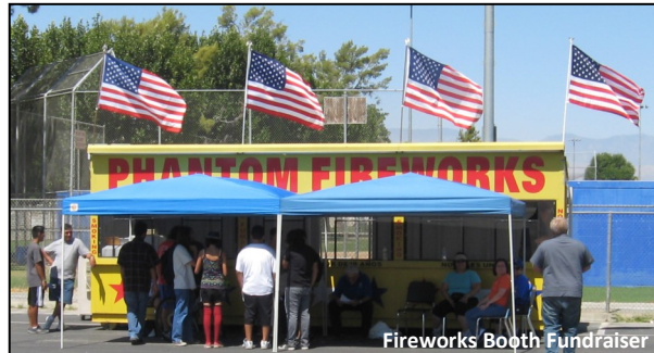
Fireworks Booth Fundraiser