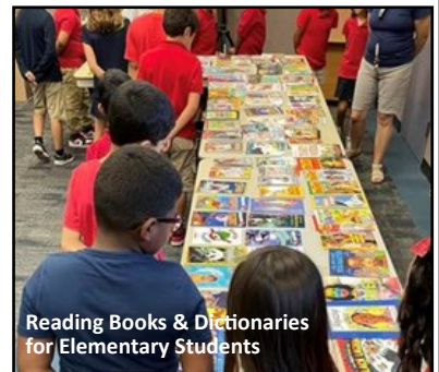
Reading Books & Dictionaries for Elementary Students