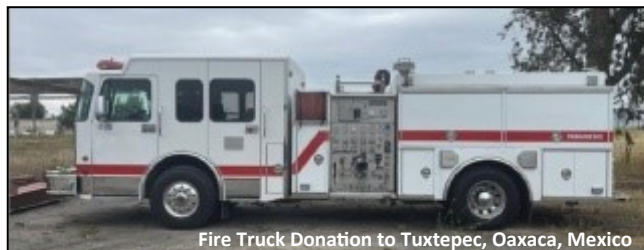
Fire Truck Donation to Tuxtepec, Oaxaca, Mexico