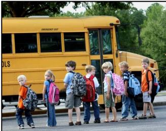
Pay for Bus Transportation for 3rd Graders to visit the CV Museum