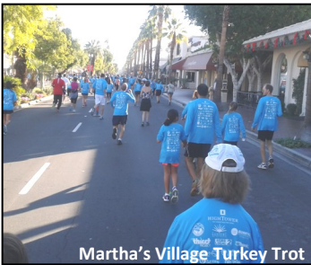
Martha's Village Turkey Trot