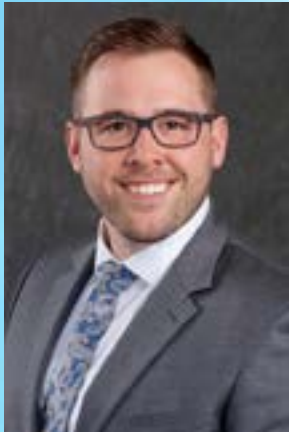
Company: Edward Jones Title: Financial Advisor