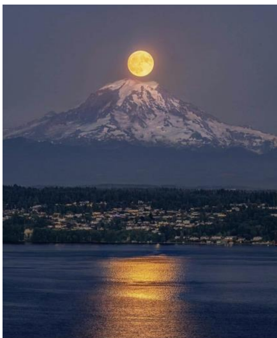
This is the moon rising over Mt. Ranier on October 29.

Help Rotary fight disease! Feed the pig at the meeting, send fines and donations for Polio Plus here , or mail your check to: Claremont Rotary Foundation PO Box 357 Claremont 91711