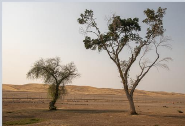
Merced County Roadside Rest Trees