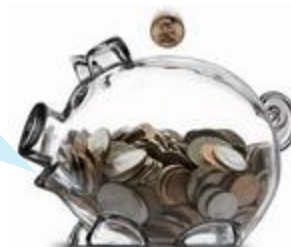
Bacon Bits Let's fill up the pig!

Remember to participate in the auction online!