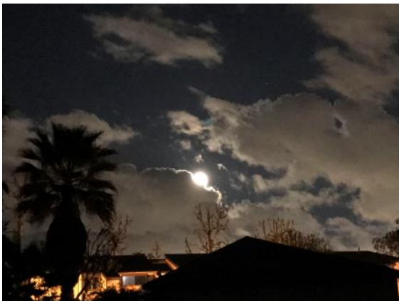
Tuesday night in Claremont