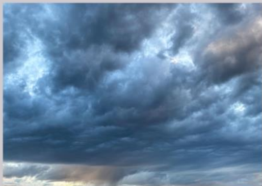
Promise of Rain