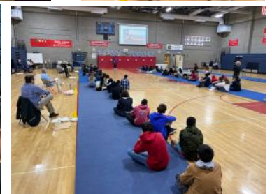
Attentive students and instructors with the right moves make all the difference.