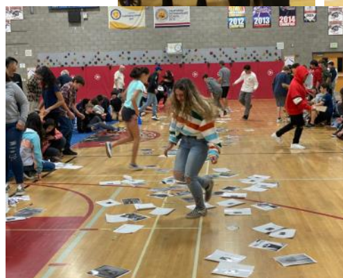
Let's play "What's in your Go Bag?"