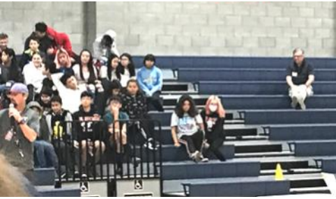
Photographer Peter Weinberger picked a quiet day.....nothing to see here, but much to learn