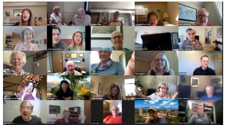
Enthusiastic (mostly muted) singing of SMILE!