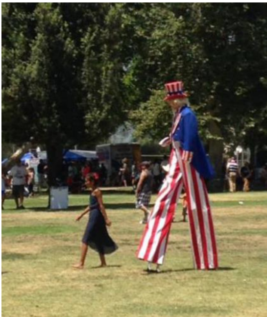
Photo of the 4th