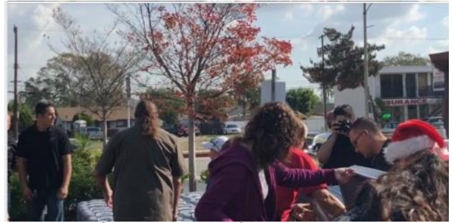
Members of the Rotary Club of Azusa helped pack suitcases for Forever Kids in December 2018.