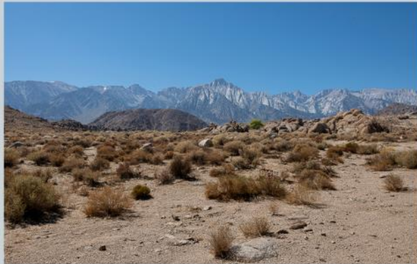
Sierras from Alabama Hills