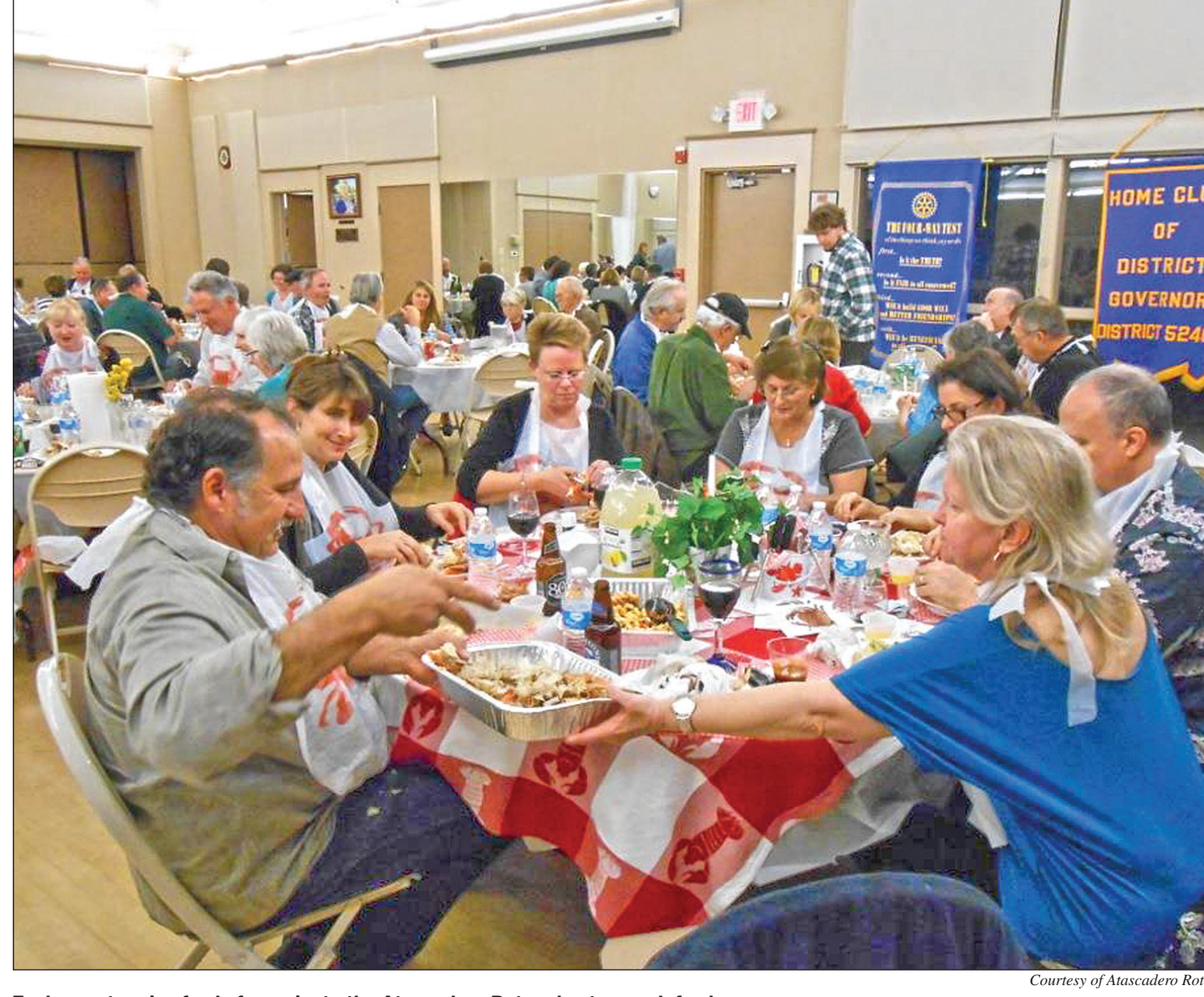
Each year to raise funds for projects the Atascadero Rotary hosts a crab feed.