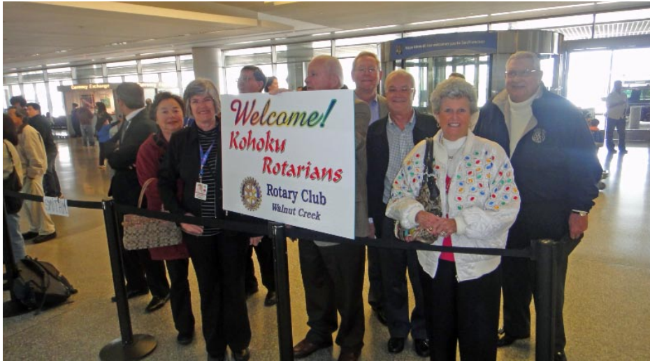
A group of Walnut Creek Rotarians wait at SFO for the arrival of friends from Tokyo.

The Rotary Clubs of Walnut Creek and Tokyo-Kohoku have had a “matched” relationship since 1967. The two clubs have an exchange student program. Each year, a college-age student visits during the summer months. Rotarians from each club visit each other during the year. The understanding, goodwill and fellowship generated through this program enhances Rotary International’s philosophy of making the world a better place in which to live.