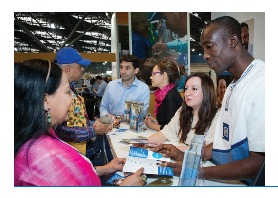
Rotary is a network of members around the world working together to exchange ideas and take action.

Another benefit of being a Rotary club member is the opportunity to have international experiences and connections. Whether you host a youth exchange student, attend an international Rotary meeting, or partner with a club in another country on a project, Rotary offers many ways to connect with people from around the world.