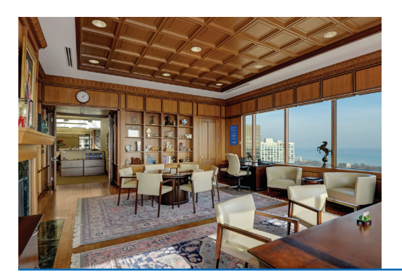
The Rotary International president's office on the 18th floor of One Rotary Center overlooks Lake Michigan.

One Rotary Center hosts more than 2,000 Rotarians and guests each year. Free guided tours in several languages are offered Monday-Friday. Email visitors@ rotary.org to request a tour.