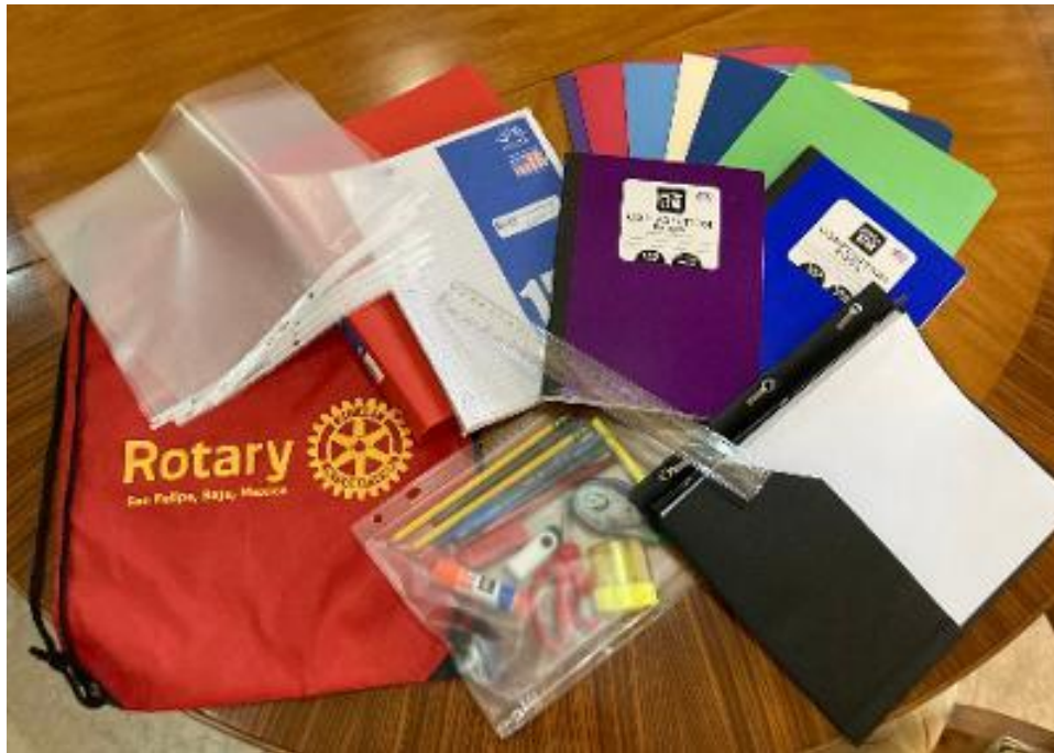
THE UTILITY BAG