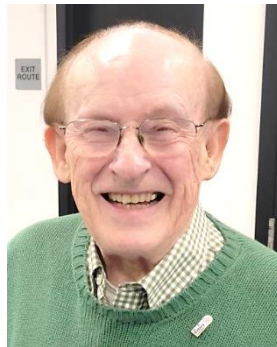
Thought for the Day