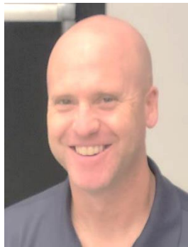
The 4-Way Test