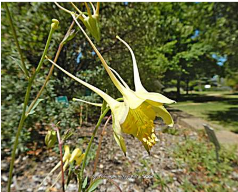
The Golden Columbine