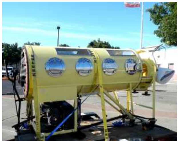
AN ACTUAL IRON LUNG WAS ON DISPLAY