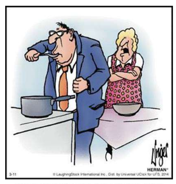
"I hope it tastes good. It's for the cat."