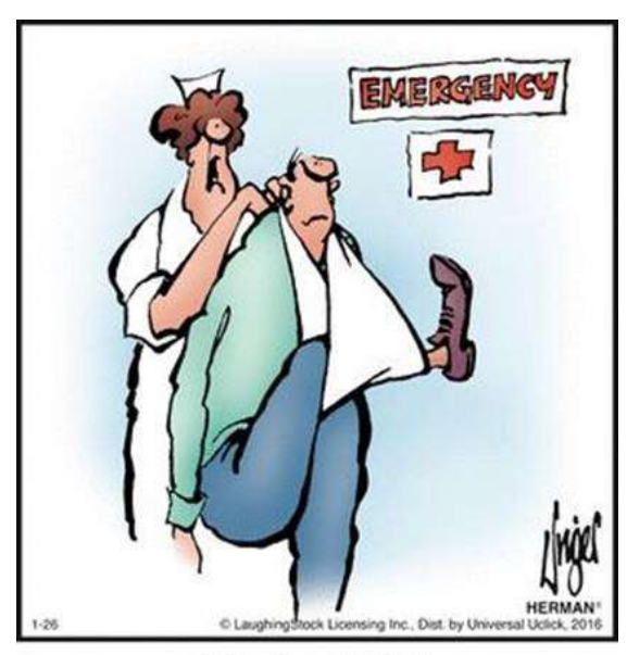
"That too tight?"