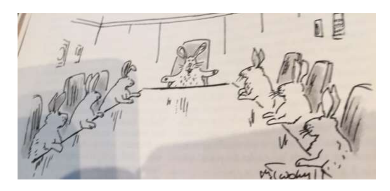
"Your Easter bonuses are hidden throughout corporate headquarters"