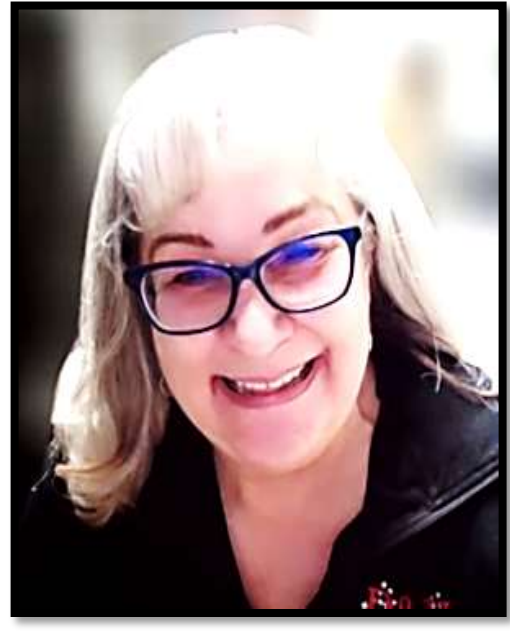
Wow, I won.