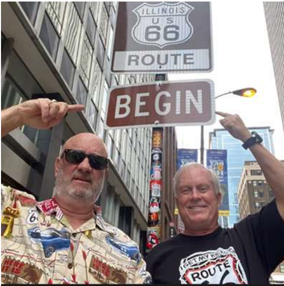
Here they are, the route they took, and what they saw along the way.